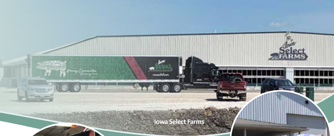
Iowa Select Farms