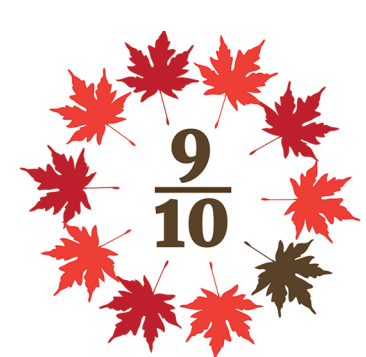
90% of deciduous trees can be pruned in the winter once the trees have gone into dormancy.

Pruning can help strengthen tree branches and promote growth. When splits in the tree's wood emerge, they expand as the tree grows. This can result in fallen branches that bring down power lines and damage electrical equipment.