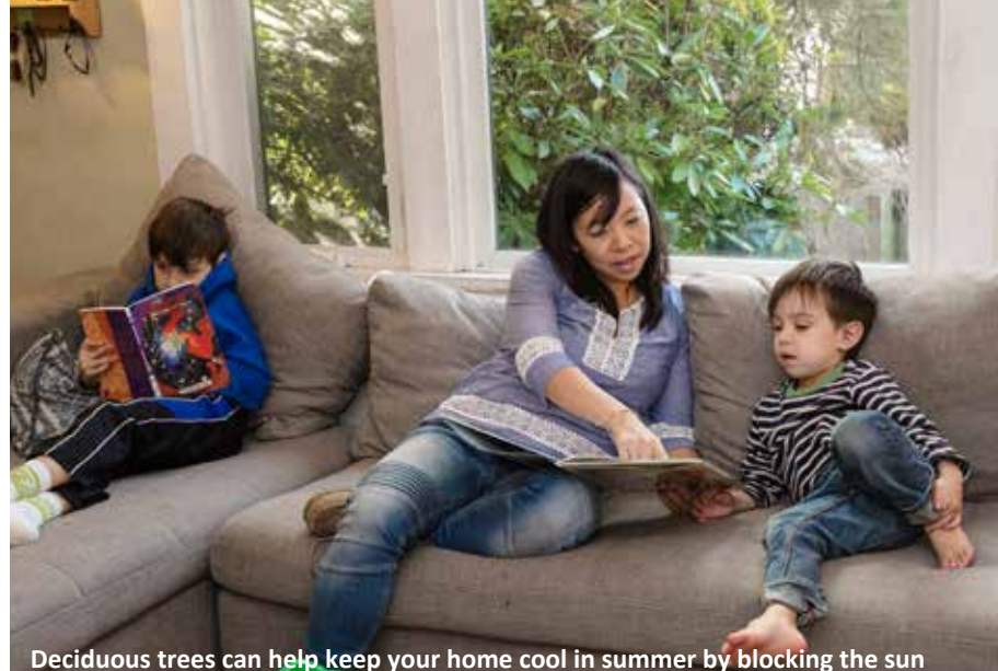
Deciduous trees can help keep your home cool in summer by blocking the sun and help warm it by allowing sunlight in during the winter.

With Iowa's cold winter climate, planting deciduous trees that lose their leaves in fall will shield your