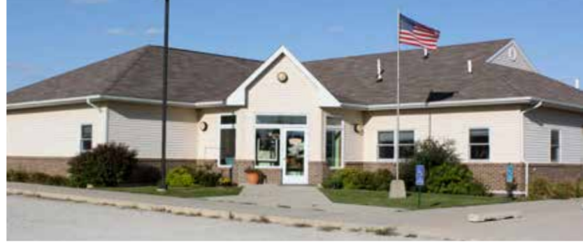
Iowa Area Development Group (IADG) has been helpful to many utility partners and communities as they have collaborated to support solutions for child care and other challenges. For more information, contact your rural electric cooperative or IADG at www.iadg.com.