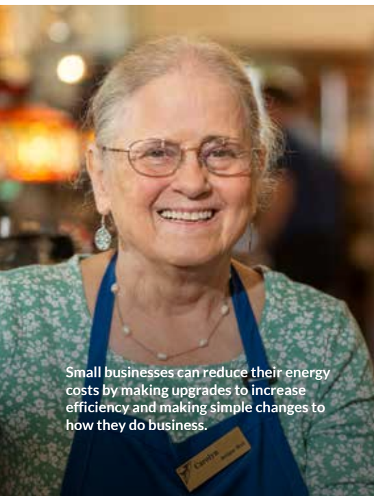
Small businesses can reduce their energy costs by making upgrades to increase efficiency and making simple changes to how they do business.