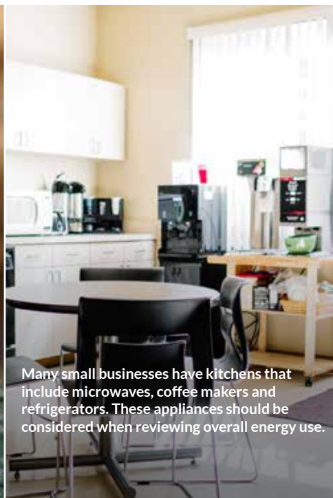
Many small businesses have kitchens that include microwaves, coffee makers and refrigerators. These appliances should be considered when reviewing overall energy use.