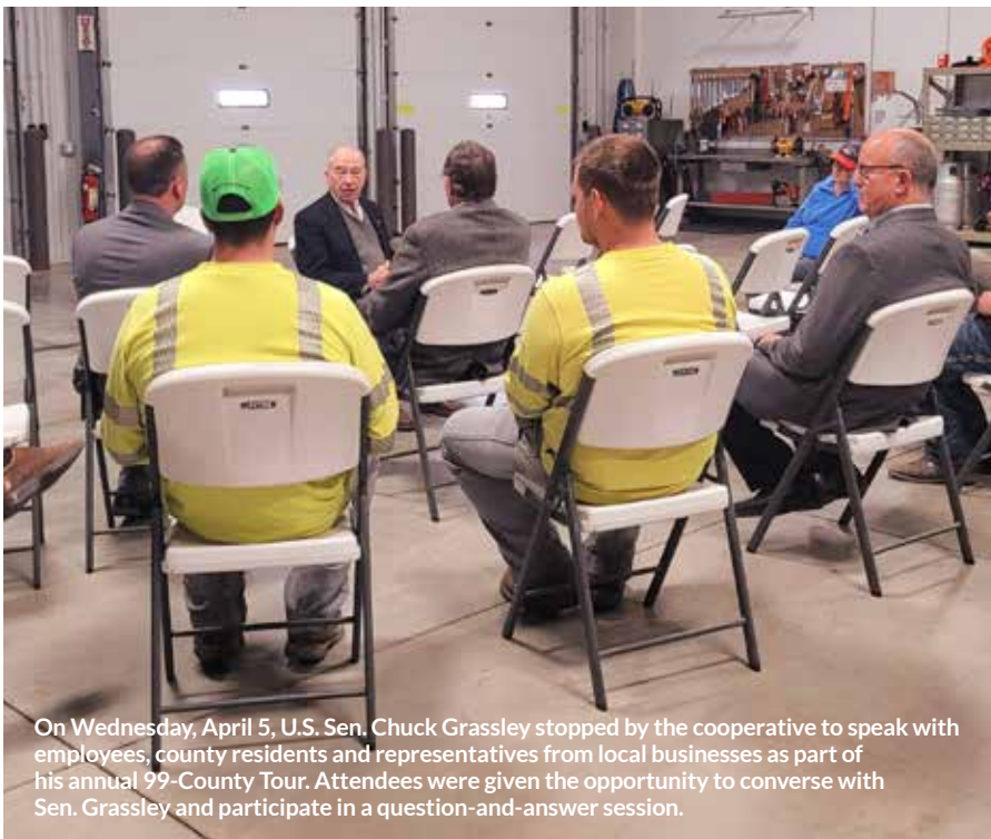
On Wednesday, April 5, U.S. Sen. Chuck Grassley stopped by the cooperative to speak with employees, county residents and representatives from local businesses as part of his annual 99-County Tour. Attendees were given the opportunity to converse with Sen. Grassley and participate in a question-and-answer session.