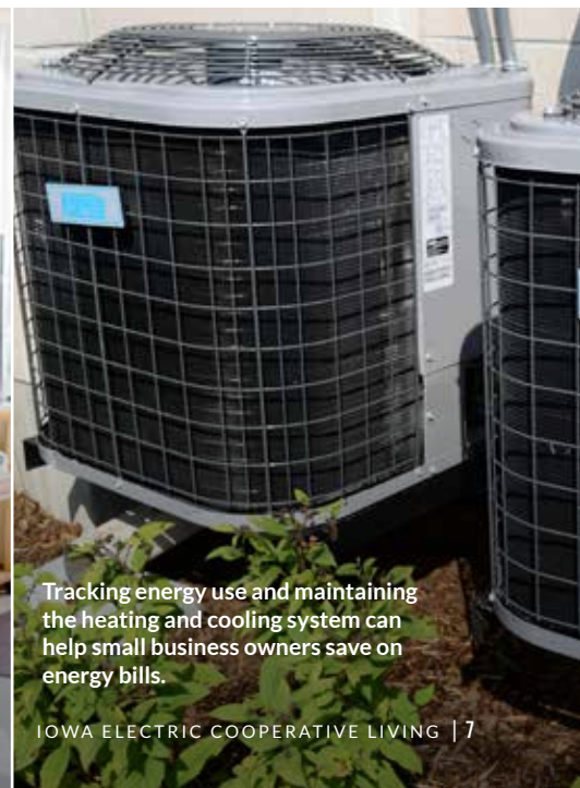
Tracking energy use and maintaining the heating and cooling system can help small business owners save on energy bills.