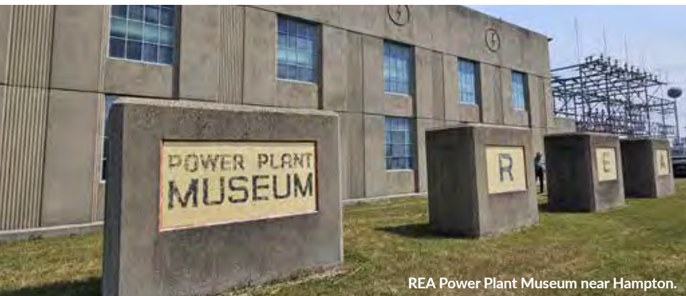
REA Power Plant Museum near Hampton.

When I heard there was going to be a tour of the Rural Electrification Administration (REA) Power Plant Museum near Hampton this summer, I was all in. As I explored the displays in the 85-year-old building, the Delco-Light plant exhibit caught my eye.